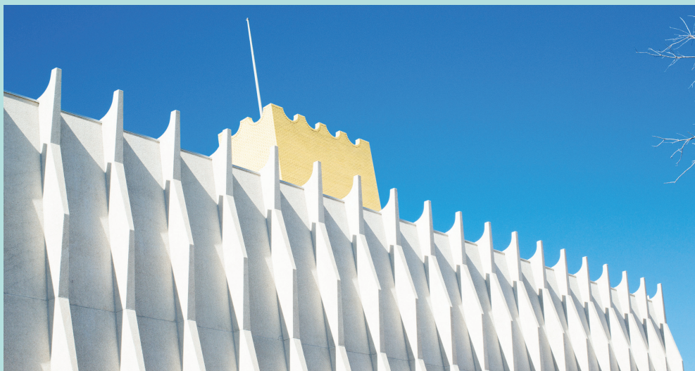
The Jessie Ball duPont Center, scheduled to open in summer 2015, will house about a dozen area nonprofit and philanthropic organizations (including the Jessie Ball duPont Fund). It also includes a conference center, training center and reception spaces.

The Center is a major economic development project for downtown Jacksonville, bringing an anticipated 200 new workers to the heart of the city. Through the project, the Jessie Ball duPont Fund is making a lasting investment in Jacksonville, demonstrating green building practices and preserving one of Jacksonville's important architectural treasures.