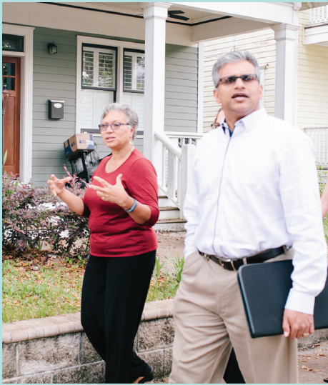
Representatives from philanthropy, government, nonprofits and higher education toured the Springfield neighborhood of Jacksonville and met with the Fund's leadership to discuss ways philanthropy can stimulate development of affordable housing.

In Jacksonville, the Fund is in the fourth year of supporting a summer youth employment program. Community-based nonprofits identify about 100 students each year who would benefit from the program. The young people then receive intensive training in the "soft skills" - how to present and conduct oneself in a professional work environment - before taking a six-week paid summer job at a local business, nonprofit or religious organization.